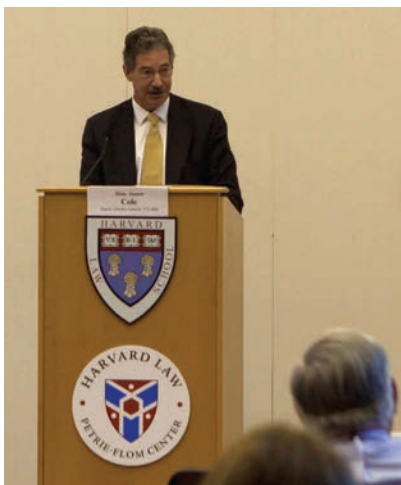
James M. Cole , Deputy Attorney General of the United States, delivered the keynote address.